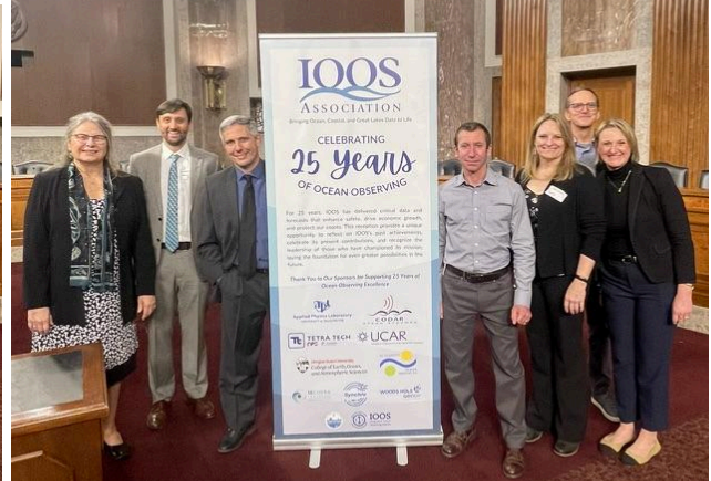
IOOS Association 25th Celebration in Washington, DC.

Left: Non-contiguous Regional Associations (CARICOOS, PaCIOOS, AOO) Right: Canadian-border Regional Associations (NERACOOS, GLOS, NANOOS, AOO)