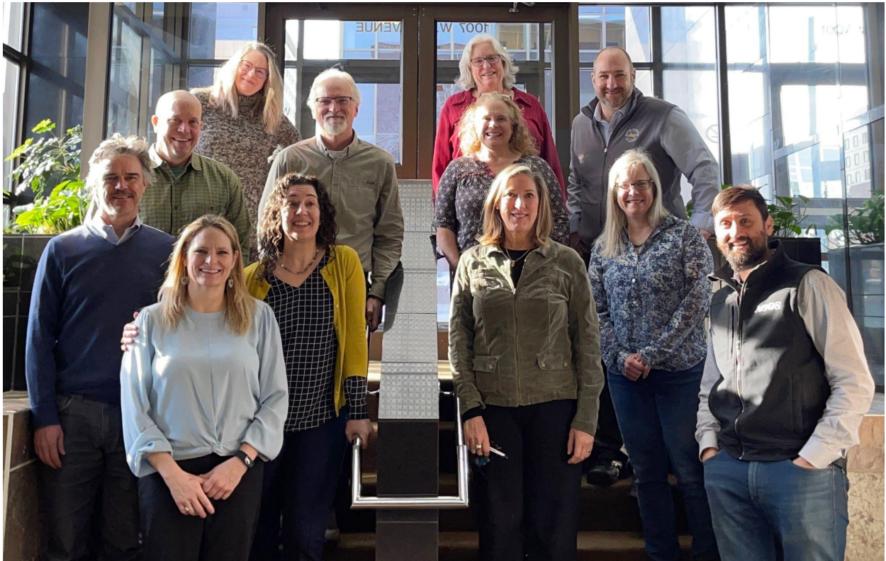
AOOS board members and staff met at the Anchorage office and virtually on April 7.