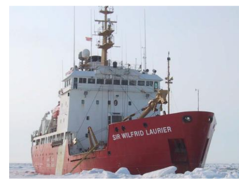
CCGS Sir Wilfrid Laurier