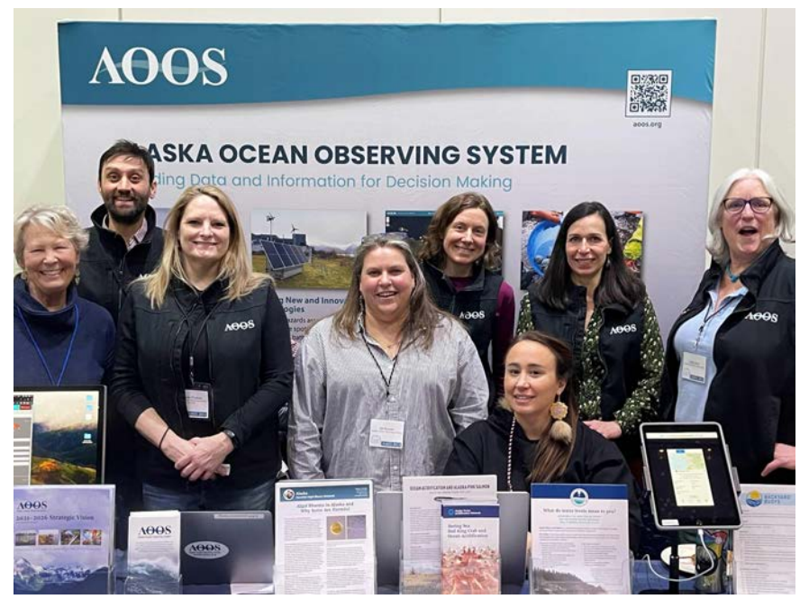
How many photos does it take for AOOS staff to look/act professional? Turns out at least six!