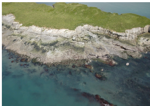
Shorezone imagery from Cook Inlet